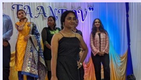
Contestants of Mr and Ms Karavali doing Ramp Walk

The true spirit of Rotaract was evident as members from different clubs came together to celebrate culture and talent. These clubs, including RCSUIET, RC St Aloysius, RC Govindasa, RC Mangalore City, RC Kinnigoli, and RC Yenepoya, contributed to the event's success, showcasing the unity and collaboration within the Rotaract community. The total strength of members from these clubs was 63.